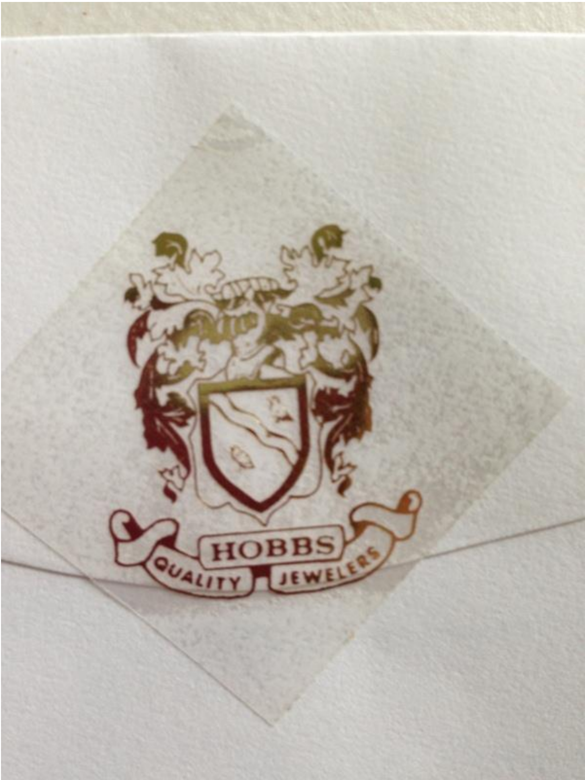
$25 Gift Certificate to "Underneath it All"